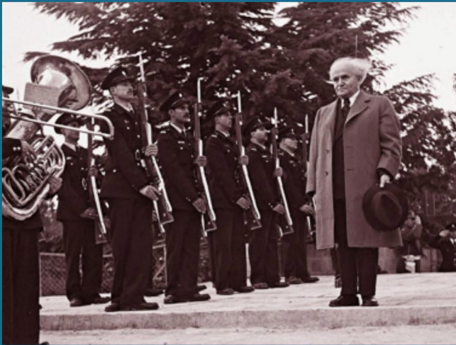
David Ben-Gurion first Prime Minister of Israel, 1948